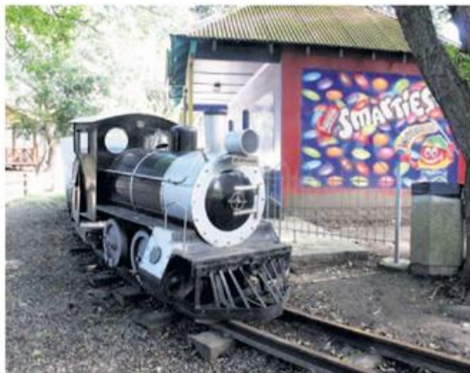
DERAILED: The Smartie train lies stationary at the East London Zoo and is in need of repairs.

"We'll support the Smartie train with an annual maintenance fee of R25 000 until 2013," he said.